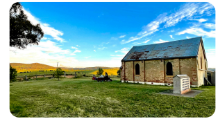
ST PETERS MUTTON FALLS 3:00PM 5TH SUNDAY OF THE MONTH