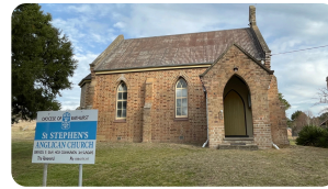
ST STEPHENS TARANA 3:00PM 2ND & 4TH SUNDAY EACH MONTH