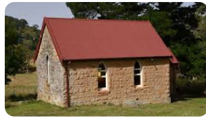
ST THOMAS' HAMPTON 3:00PM 1ST & 3RD SUNDAY EACH MONTH