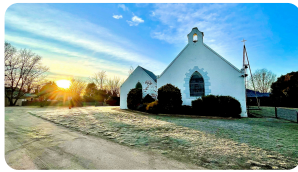
ST BARNABAS OBERON 9:00 AM EVERY SUNDAY