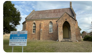
ST STEPHENS TARANA 3:00PM 2ND & 4TH SUNDAY EACH MONTH