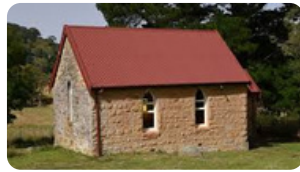
ST THOMAS' HAMPTON 3:00PM 1ST & 3RD SUNDAY EACH MONTH